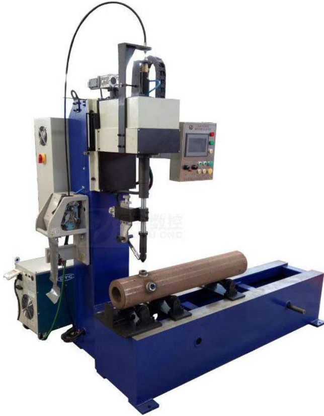
Fig. 2. Automatic welding machine for fittings from the Chinese manufacturer HAOYU [4]

technological process also requires mechanization, so separate installations have been invented for this case.